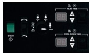
Dual Digital Control