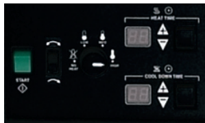
Dual Digital Control