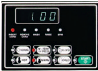
Fully programmable NetMaster™ control