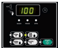
Micro-DISPLAY control (MDC)